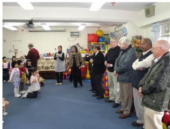
Visiting the Nursery School