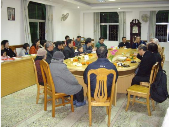
Meeting with the "Charity Community" in Mei Zhou