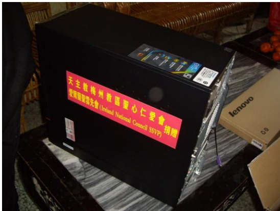
PC donated by Ireland National Council