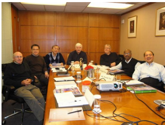
Asia and Oceania team at meeting

National Council of New Zealand also donated RMB1,000 for the work in China. The representatives of the school hosted a lunch to thank them for the donation. The members met the members of the "Charity Community" after attending the mass celebrated by Bishop Liao, the bishop of Meizhou Diocese in the evening. The Asia and Oceania team were very impressed by the charity work they have done for the poor in Meizhou. The visit ended by taking the long distance bus back to Hong-Kong (Special Administrative Region of China) on 16th January, 2010 .