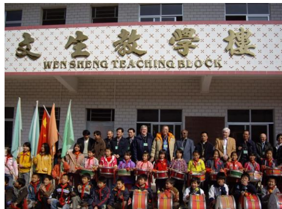
Wen Sheng (Vincent) Teaching Block