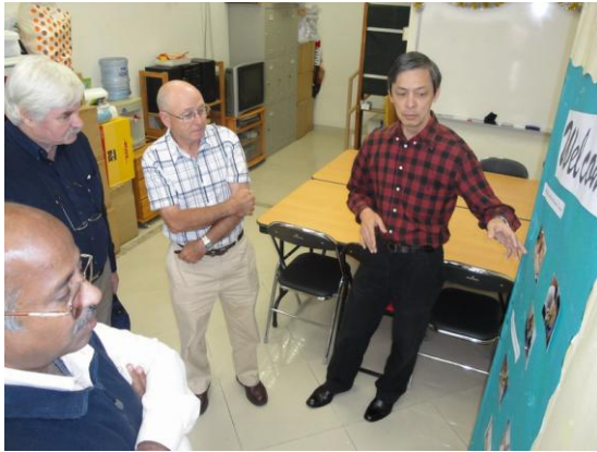
Visiting Ozanam Centre